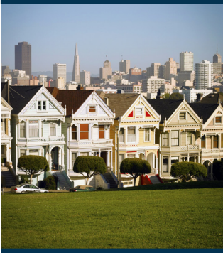
chart HOME COMPARISON

Remembering each home would appear easy, but it can quickly become confusing. Which home was near the school? Which one had the great pool? Did it have a family room? How many bathrooms? In the “Something Memorable” category, note something you think is unusual and memorable about each home, such as a stained glass window, fruit trees, a child’s playhouse. This will make it easier for you to recall the property later and refer to a specific address. And, last but not least, maybe the most important question, does this house feel like home?